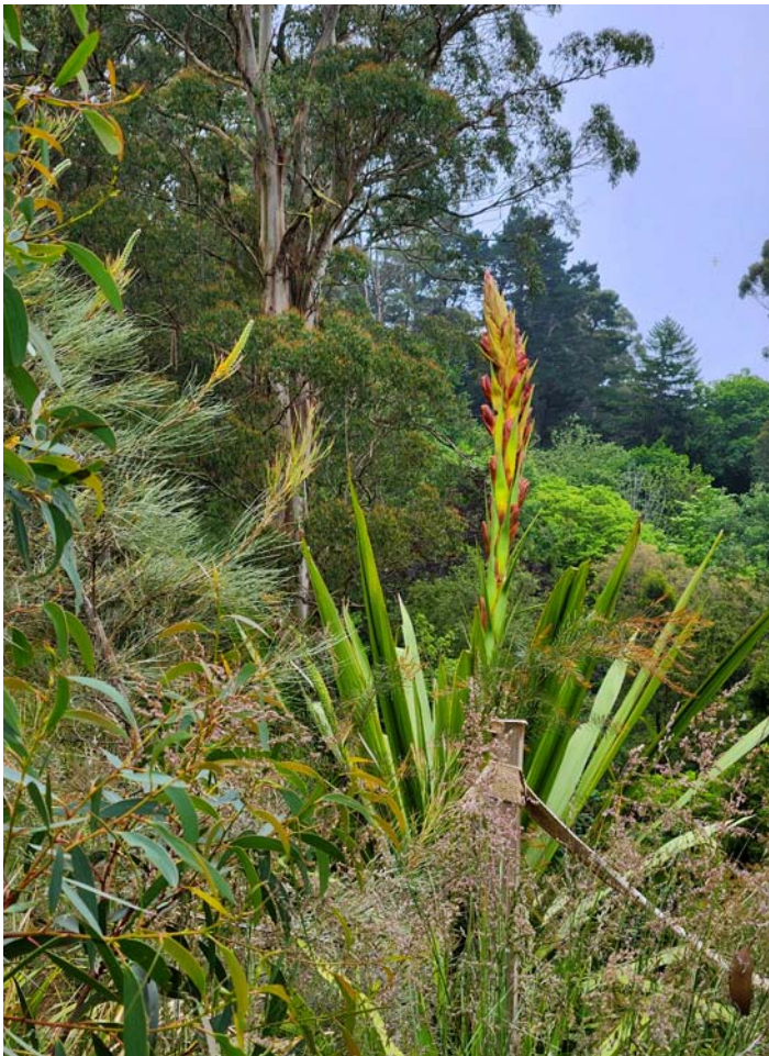
Above: Doryanthus palmeri at the Chelsea Garden at Olinda.

This garden is on offer as an excursion at the ANPSA 2024 Biennial Conference.