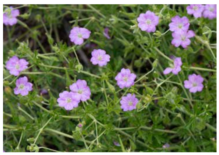
Geranium sp. 1.

The reserve is a Themeda dominated grassland and home to a large population of Striped Legless Lizards ( Delmar impar ). Over the last 30 years a grassland infested with Serrated Tussock has been slowly transformed into a superb example of the original flora. Staff and The Friends of Iramoo volunteers have shifted the balance towards a Themeda triandra system and reintroduced rare species such as Pimelea spinescens subsp spinescens , Rutidosis leptorhynchoides , Geranium sp 1 and Podolepis linearifolia .