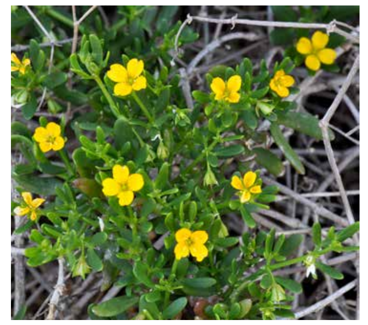
Roepera billardierum. Syn. Zygophyllum billardierum.