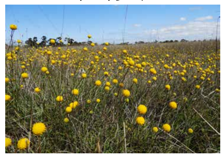
Fields of Gold.

Less than 2% of Victoria's grasslands remain intact and some of the best and most diverse examples are on the outskirts of Melbourne. Our Grasslands excursion will include the Evans Street Grasslands in Sunbury and Iramoo at the Victoria University which are two of the best examples of original grassland flora of the Keilor basalt plains. The Victorian volcanic plains grasslands were described as fields of gold by the first waves of