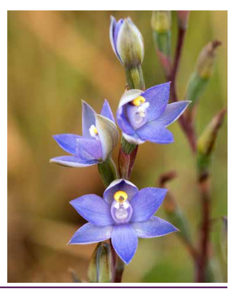
The lymitra\ arenaria.

Walking quietly and looking closely reveals many resident pollinators. When managed well, our grasslands can be very diverse ecosystems with flowers, herbs, lillies and orchids as well as a variety of grasses and people on this excursion will have the rare opportunity to see and hear about what is being done to preserve and protect the remaining remnants.