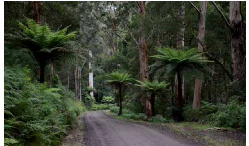
Road to Grey River Walk. Graham Goods.

The second (a bus drop off) is a short walk which starts 6-8km up the Grey River road to the Grey River Scenic Reserve. The road winds up through coastal Eucalyptus viminalis and Eucalyptus globulus and E. obliqua (Messmate). This drier forest changes as the altitude decreases, Acacia stricta and A. verticillata disappear as the road descends into the Grey River - this is lush Otways rainforest. The road is lined with ferns, Dicksonia , Polystychem , Blechnum etc. From the obvious little picnic area walk back across the bridge and climb over the road barrier to access the narrow foot track which for the first 100 metres or so is lined with glow worms - a great show at night. The tree ferns along this section are amazing as they are enormous and have never been touched by fire. Filmy ferns, mosses, lichens and fungi abound. The