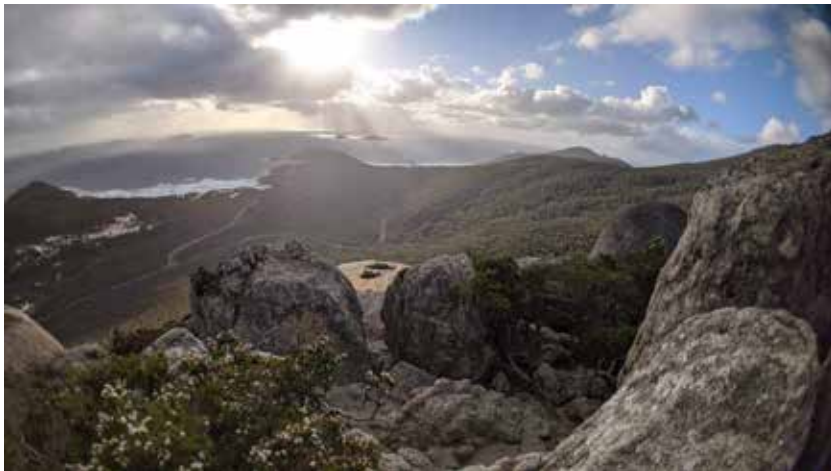
Wilsons Promontory. Nicole Beres.

The tour bus will have an expert guide on board and we have lined up speakers in the evenings highlighting the flora of the tour and also will visit some superb private gardens and the Celia Rosser Gallery. This article highlights four of our wildflower destinations.