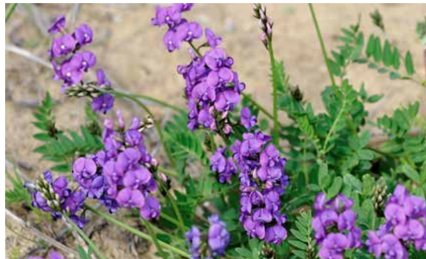
Swainsona lessertifolia . Chris Clarke.

In coastal areas splashes of purple are commonly provided by Swainsona lessertifolia , the Purple Swainson-pea (photo below). Leucophyta brownii , Cushion Bush displays its stunning silvery-white foliage throughout the year and survives in the most exposed and seemingly inhospitable of sites on coastal cliffs and sand dunes. It does not have spectacular flowers but is an outstanding foliage plant, suitable for cultivation in sunny garden situations or in containers.