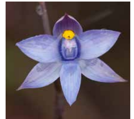
Thelymitra malvina.