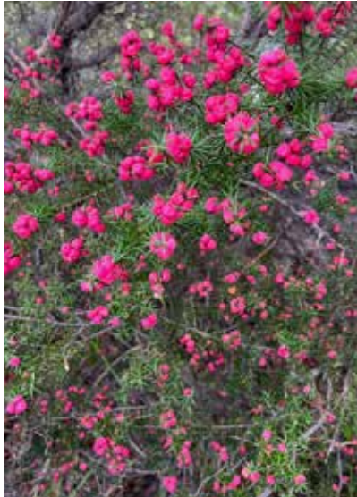
Leptecophylla juniperina subsp. oxycedrus . Chris Clarke.

Victoria's Floral Emblem, Epacris impressa , Common Heath, is also abundant at the Prom. The spikes of small tubular flowers produced mainly in winter and spring can be white, light pink, deep pink or reddish. Beard-heaths in the genus of Leucopogon also occur in the National Park and can be readily identified by the fringed or 'bearded' petals on the flowers. Another member of the heath family, Leptecophylla juniperina subsp. oxycedrus , a large shrub covered in crimson berries in Autumn is a Cyathodes -like plant that shows the strong link to the flora of Tasmania.