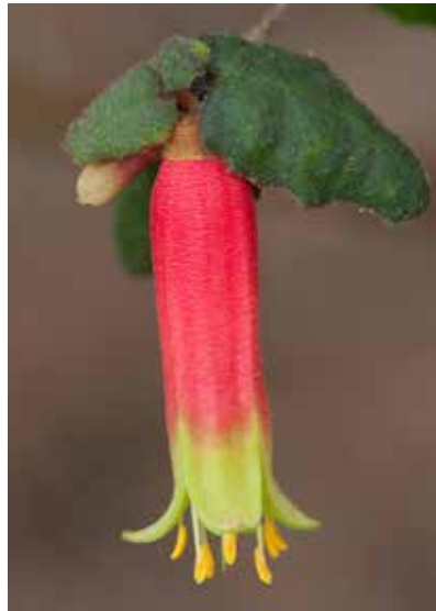
Correa reflexa var. reflexa . Chris Clarke.

In autumn and winter one of the highlight species is the Common Correa, Correa reflexa var. reflexa . The forms most frequently seen in the park have pendent bells of red tipped with green or greenish yellow, but other colour variations can also be found.