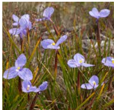
Patersonia glabrata.