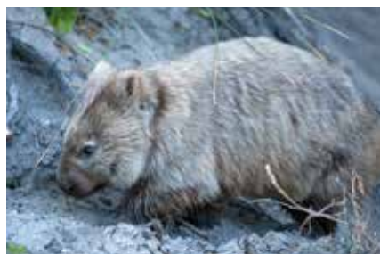
Wombat. Chris Clarke.

One of the delightful aspects of visiting the Prom is that many animals such as emu, kangaroo and wombats are easily seen. The wombats like the one pictured below are lighter than most and Chris's family have always referred to them as the blonde Wombats due to their beach side bleaching existence.