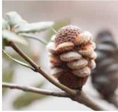
Banksia saxicola fruit. Chris Clarke.

Between these banksias alone there are flowers produced throughout most of the year. Banksia serrata begins flowering in mid to late spring and continues right through summer. Banksia saxicola blooms through summer and autumn, while in early autumn Banksia integrifolia takes over and produces its yellow flower-spikes through until the end of winter. Banksia marginata has deep yellow flower-spikes of about 10cm long from late summer until spring while Banksia cunninghamii peaks in autumn and winter when the erect honey-coloured flower-spikes of 15 - 20cm tall are a magnet for the native birds.