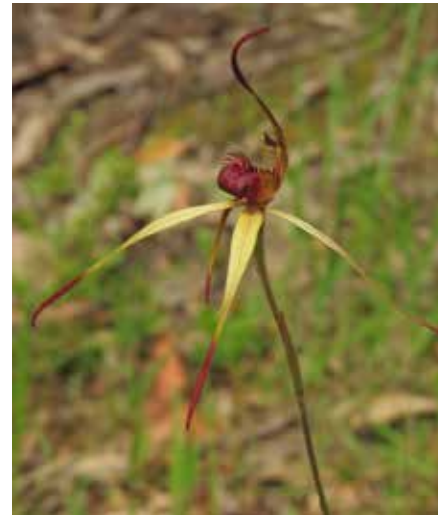
Caladenia australis . Mike Beamish.

The Reserve is about 58 hectares in size, has never been cleared and is surrounded by medium density housing on its north, east and west sides, and by larger rural residential blocks on the south. The vegetation consists of Lowland Forest on the slopes, consisting of various species of Eucalypts (Messmate, Yertchuk, Silver Stringybark, Narrow-leaved Peppermint), Wattles (Blackwood, Silver), Banksia (Hairpin, Silver), Hakea (Furze, Needlewood), Cherry Ballart, Peas, Daisies, Orchids and many more. In the gullies are Fern Swamps, with Scrambling Coral Fern ( Gleichenia microphylla ) a highlight and the Moondarra Spider Orchid a variant Caladenia australis is found here.