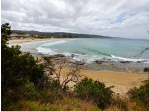
Lorne Coast Walk. Miriam Ford.

This is a spectacular and very easy going walk on gravel paths and boardwalks. It goes for 1 km from the Lorne Surf Lifesaving club to the Lorne Pier. You take in the sweeping coastal views looking back towards Lorne and the surf coast to Anglesea, watch the surfers catching the break if the weather is right and take in views of the Pier where the road