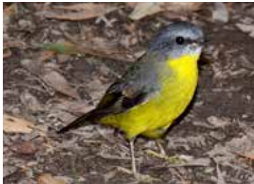
Yellow Robin.

Here we will walk through an ancient rain forest, along an 800m circular self-guided boardwalk among giant beech trees hundreds of years old which tower over ancient tree ferns. Keep your eyes peeled for birds, as there are around 43 different species that aren't found anywhere else in the world.