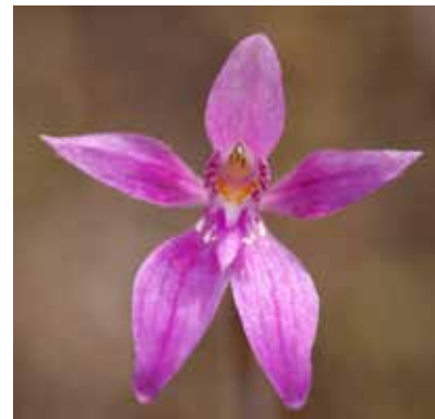
Caladenia latifolia . Chris Clarke.

The park is also rich in native ground orchids, including Spider-orchids in the Caladenia genus including the delightful Caladenia latifolia . There are Chiloglottis species - Bird Orchids, species of Pterostylis or Greenhood orchids, as well as Sun-orchids, Bird-orchids, Mayfly-orchids, Austral Lady's Tresses and Gastrodia sesamoides , Cinnamon Bells which is incapable of producing chlorophyll. On a trip with APS Keilor Plains we found a Sun-orchid previously unrecorded in the park Thelymitra malvina in full flower in the pouring rain!