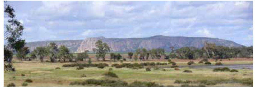
Mount Arapiles. Graham Goods.

yellow-gum, Eucalyptus microcarpa and Eucalyptus leucoxylon ; buloke, Allocasuarina luehmannii ; and white cypress pine, Callitris glaucophylla .