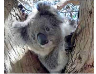
Koala, Kennett River.

where koalas can be spotted; Acacia melanoxylon , Coprosma quadrifida . Olearia argophylla and Olearia lirata , tree fern - Dicksonia antarctica , Polystychem and an odd Hedycaria angustifolia , Prostanthera lasianthos , Pomaderris aspera are to be seen. The track proceeds for several hundred metres beyond the houses and the small water pump shed that supplies the store and camp.