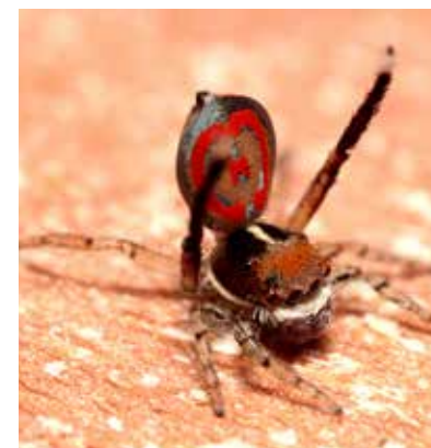
Peacock Spider, one of many in The Ark Garden.