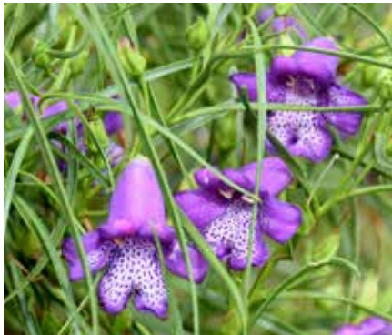
Eremophila Meringur Isaac. Kevin Sparrow.

With Council permission the Warrnambool and District Group of the Society for Growing Australian Plants, formed in 1976, established a waterwise garden around what is now the kindergarden. The Friends of Swan Reserve was formed in early 2010. They have worked hard to establish a new Wollemi Pine Bed, a Grasstree Bed and cleared and rejuvenated many of the old beds. The overgrown Banksia Bed was opened up with a walking track installed through the middle so people could easily see the many different Proteaceae species. Smaller low growing plants were selected to keep the bed open and discourage intruders. The Friends have also installed educational signage to name and explain many of the