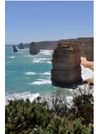
Twelve Apostles. Kevin Sparrow.

The tour will stop off at the famous 12 Apostles, magnificent rock stacks that rise up majestically from the Southern Ocean on Victoria's dramatic coastline. Erosion of the mainland coast's limestone cliffs began 10 to 20 million years ago, with the stormy Southern Ocean and blasting winds gradually wearing away the softer limestone to form caves in the cliffs. Enjoy a brief walk to take in the rugged views of the coastline, before we travel on to the popular seaside town of Port Campbell.