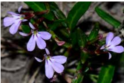
Lobelia anceps . Maree Goods.

This is a dense rainforest of myrtle beech, blackwood and tree-ferns, with an understorey of low ferns with mosses and fungi. It has prolific plant growth. It is one of the wettest places in Victoria. Here a short 1.2km return walk rated easy, takes approximately 35 minutes to complete.