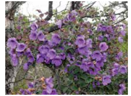
Prostanthera rotundifolia.