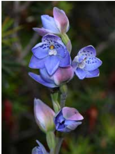
Thelymitra ixioides . Maree Goods.

Mount Arapiles is a spectacular rock formation that rises about 140 metres from the surrounding Wimmera Plains. Mount Arapiles is widely regarded as a world renowned climbing area for rock climbers. The Mount has been preserved for its diversity of flora totalling nearly 500 species including an endemic mint bush, Prostanthera arapilensis ; the rare and endangered species rock wattle, Acacia rupicola ; and the skeleton fork fern, Psilotum nudum . Mt Arapiles is covered in low, open forest of box and