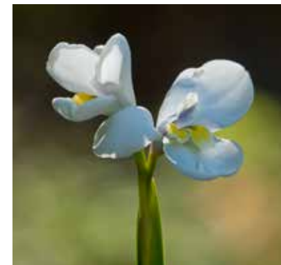
Diplarrena moraea . Chris Clarke.

Another small tufting plant that provides an eye-catching pink floral display in spring and early summer is a trigger plant Stylidium armeria , which was reinstated as a separate species after being in the Stylidium graminifolium complex.