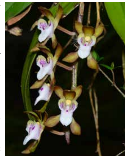
Sarcochilus australis Chris Lindorff.

Historical use of the landscape included the Morwell town water supply in the early 1900's from a weir and pipeline in the Billy Creek valley, sand and gravel mining in Fosters Gully in the 1920's and logging during the 1940's and 1950's. There were also some gold diggings in Foster's Gully and a rifle range and lodge along Billy Creek during World War 2. All of these activities have left visible remnants in various parts of the park.