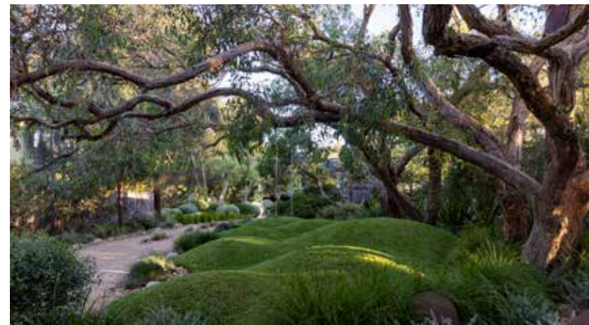
Sunnymeade, Anglesea Garden of Peter and Simone Shaw. S Griffiths.

Peter and Simone Shaw purchased their block in 2000. There were twisted stringy barks ( Eucalyptus obliqua ) that gracefully stood on the site and evoked a sense of magic that influenced their garden on all levels. The house was built at the end of the block enabling all the trees to stay just as they were. The free-form design reflected the natural twisting shapes in the trunks and worked its way under the trees. The trees provided an opportunity for children's play and cubby houses, adding to the childhood magic that was created. The plants selected for under the trees needed to be tough and drought tolerant. Once they worked out what would grow, they simply repeated the patterns. In 2014 Sunnymeade won the Victorian Landscape Awards - Plants in Landscape