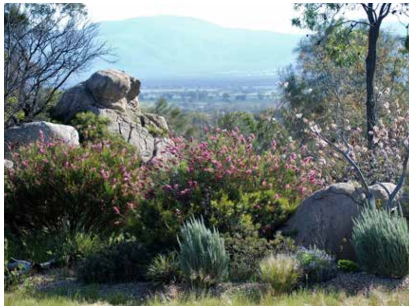
Grevilleas growing at Panrock Ridge garden. Neil Marriott.

species), a large Mallee eucalypt garden, Acacia garden, rainforest gully and much more. The gardens are designed primarily for wildlife with over 180 native birds being recorded for the property as well as numerous native animals and reptiles.