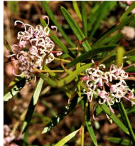
Grevillea gariwerdensis growing in the WAMA covenanted woodland. Neil Marriott.

Nestled at the foot of the mountains just outside Halls Gap is the wonderfully diverse WAMA property. This will be the site for the Wildlife Art Museum of Australia, with a dedicated world class gallery featuring all forms of wildlife art, a beautiful Australian native botanic garden, areas of natural Grampians heathy woodland and wetlands.