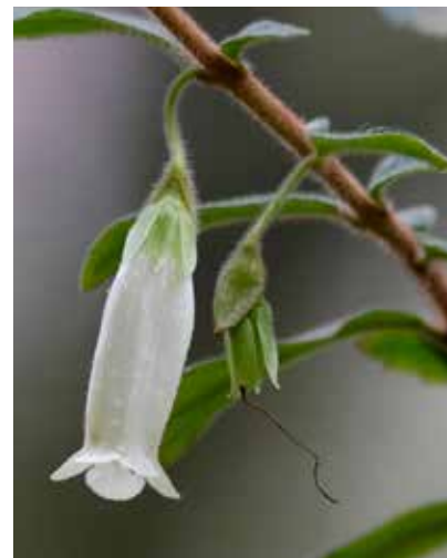
Fieldia australis . Chris Clarke.

pockets is Fieldia australis . The ground layer consists of many species of ferns (at least 35) and orchids (at least 47 have been recorded, but some have not been seen for many years) amongst grasses, herbs and fungi. On the drier ridges, Messmate ( Eucalyptus obliqua ) and Prickly Stringybark/Yertchuk ( E. consideriana ) become dominant above many species of daisies, peas, small wattles, sedges, lilies and rushes.