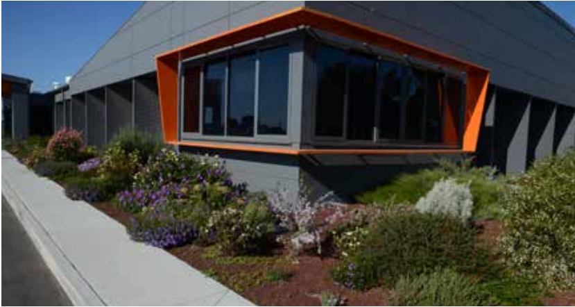
Horsham Church of Christ Garden. Maree Goods.

The Horsham Church of Christ and surrounds cover four industrial blocks. Several years before the opening of the Church in April 2018, the southern and part of the western boundaries were planted out in windbreak trees and shrubs. A small team of people worked tirelessly to develop and prepare the garden beds which were then mostly planted out with a variety of natives in time for the opening of the Church. The aim of the garden is to be a welcoming, peaceful and happy place.