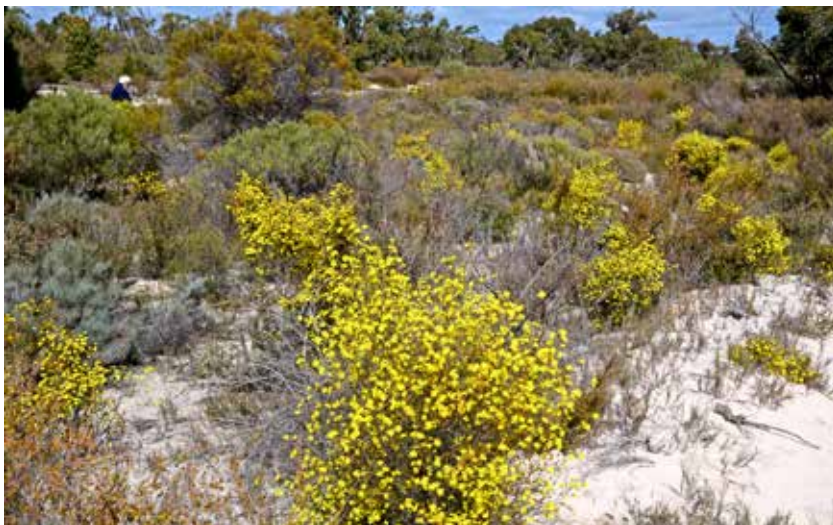
Phebalium stenophyllum . Graham Goods.

The Little Desert is a national icon that doesn't live up to its name but is well covered with vegetation and can be very floriferous from late winter through to midsummer. It is bordered by the South Australian/Victorian border in the west and the Wimmera River in the east making it about 90 kilometres long and approximately 20 kilometres wide. It is mainly undisturbed by human activity even though there was some