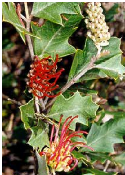
Grevillea infecunda . Anglesea Grevillea. Margaret MacDonald.

Another endemic plant, registered as vulnerable at both state and national level is the Grevillea infecunda , the Anglesea Grevillea. This low-growing plant exhibits a wide variation in leaf size and shape, and in the intensity of the colour of the flowers. It does not produce seeds but reproduces by root suckers.