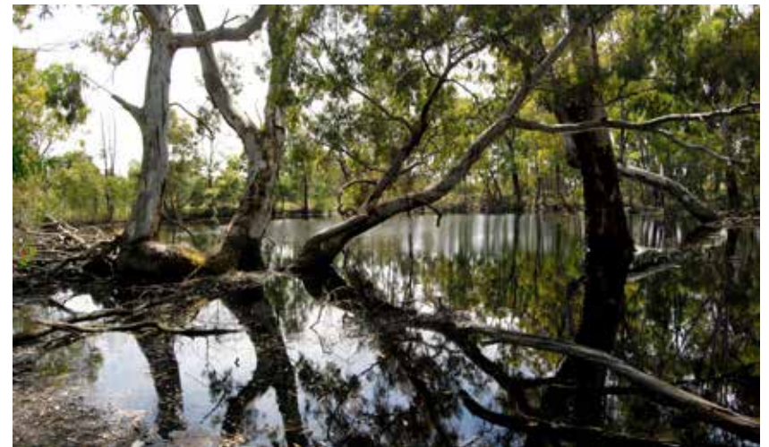
Redgum wetlands at WAMA. Neil Marriott.

Of note for this tour will be the inspection of the Grampians Endemic Garden, which contains a very large collection of unique Grampians plants. The long term aim is to hold the complete collection of all 77 Grampians endemic plants, as well as a broad range of all the genetic diversity of this endemic flora. Not yet open to the general public, this will be a wonderful opportunity to see this garden in its early stages of development.