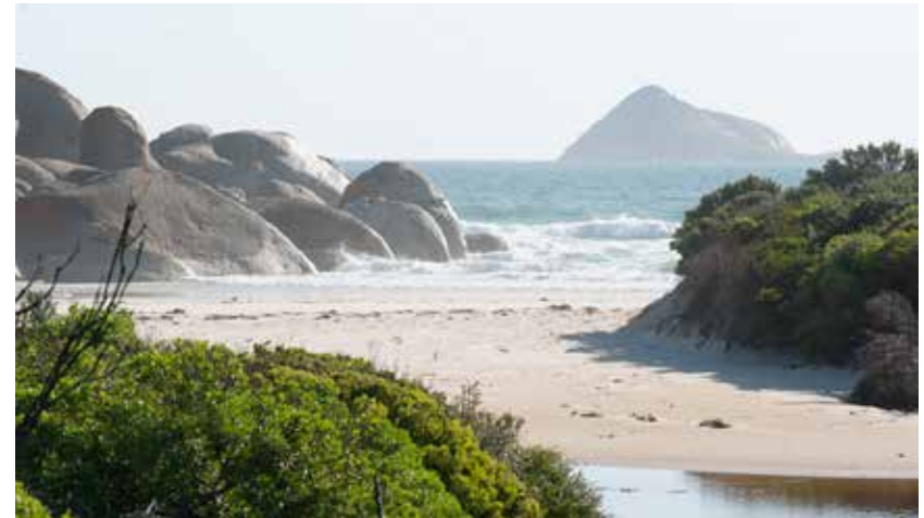
Picnic Bay looking towards Norman Island. Chris Clarke.

The Prom includes mountains, massive granite outcrops, boulders, creeks, sand dunes, cliffs, inlets and stunning beaches. The vegetation is therefore extremely rich and diverse with shrublands, wetlands, heathlands, exposed coastal vegetation plus fern gullies and cool temperate forests.