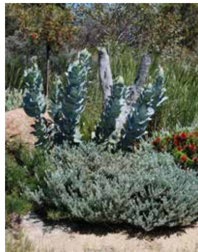
Panrock Ridge garden. Neil Marriott.

Panrock Ridge is the home to the Plant Trust Australia official Grevillea Collection, with over 330 species and subspecies under cultivation. Panrock Ridge is in the foothills of the Black Range, a large granite intrusion just to the east of the Grampians. As well as the Grevillea Collection, there is also a very extensive collection of hakea (over 165