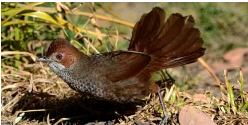
Rufous Bristlebird.