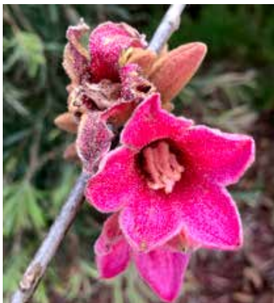
The first Brachychiton flower. Ross Dawson.

garden beds, poly tunnel, hothouse and three orchards consisting of over 40 trees and 5 beehives. On the western side of the orchard is a native food hedge consisting of lemon myrtle, aniseed myrtle and Illawarra plums – the hedge was planted to protect the orchard from the winds. They are also having some success with Muntries ( Kunzea pomifera ) which frequently appear on the menu, Tasmanian pepper berry, Midyim berries and Warrigal greens.