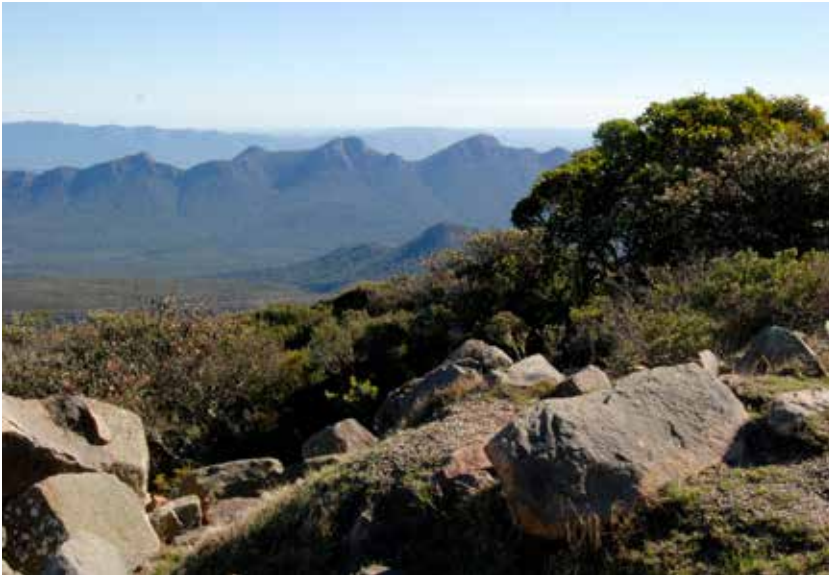
Mt William looking towards the Serra Range. Neil Marriott.

The highest peak in the Grampians, at just over 1,134 metres supports a rich subalpine flora, and numerous endemic species. On the very top we will see several endemic eucalypts including the beautiful Grampians Snow Gum Eucalyptus pauciflora subsp. parvifructa . We will drive to the carpark, almost at the top. Depending on our levels of energy, we will walk up the road to admire the many beautiful native plants, and the numerous native birds that live in these high country woodlands. Leaving Mt William we will drop down into the valley floor to reach the tourist capital of Halls Gap where we will stay the night.