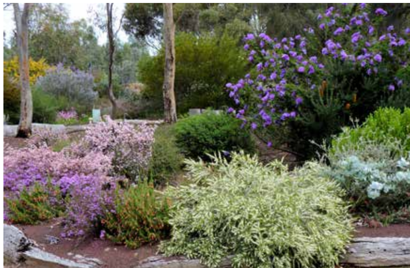
Wartook Gardens. Royce Raleigh.