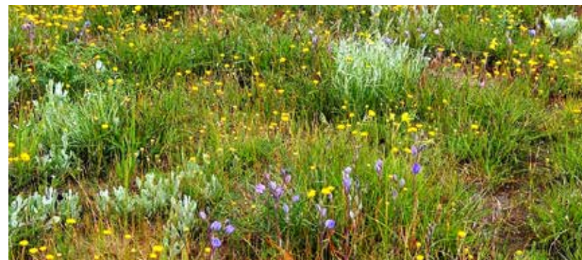
Native grassland in the spring. E Fenton.

Western Victoria supports some of Australia's most beautiful, rare and seasonally spectacular plant communities. The once-extensive Natural Temperate Grassland and Grassy Eucalypt Woodland communities of the Victoria Volcanic Plain (VVP) are both listed as critically endangered under the Australian Government's Environment Protection and Biodiversity Conservation Act (EPBC 1999). They are also among Australia's most florally spectacular plant communities, particularly during spring. Abundant native perennial wildflowers (forbs) dominate the remnants from mid-September to late November, at which time native grasses such as Wallaby Grass ( Rytidosperma spp.), Spear