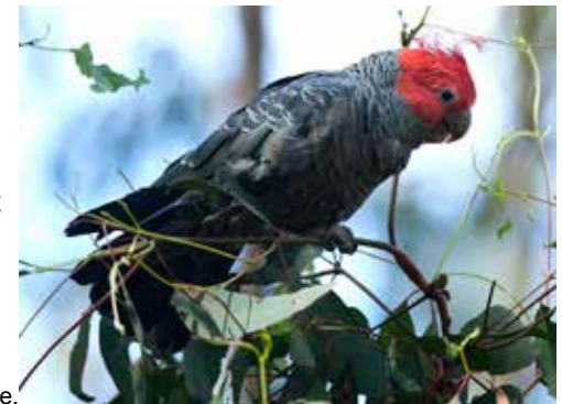
Gang Gang Cockatoo. Chris Clarke.

Numerous tall trees are present, with groves of Acacia melanoxylon - Blackwood Wattles, Nothofagus cunninghamii - Myrtle Beeches and over a dozen species of Eucalyptus . Eucalyptus baxteri (Brown Stringybark) is widespread and has coped well with fire being a “resprouter” with thick bark and threatened Gang Gang Cockatoos can often be seen feeding on them. The windswept areas are where Sheoaks often dominate, including Allocasuarina verticillata , the Drooping Sheoak, and