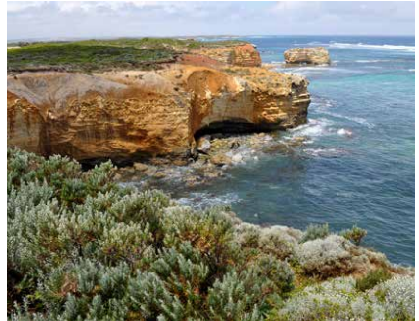
Bay of Islands. Kevin Sparrow

Further along the Great Ocean Road we will stop off at the Bay of Islands Coastal Park where you can enjoy more cliff top walks and scenic lookouts like London Bridge and be able to check out some of the local native plant species.