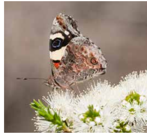
Kunzea ambigua with Australian Admiral Butterfly. Chris Clarke.

Other medium to large shrubby plants include the white-flowered Kunzea ambigua and Leptospermum juniperinum and Leptospermum laevigatum . The flowering Kunzea ambigua cover hillsides in spring, attracting lots of butterflies and smelling strongly of honey.