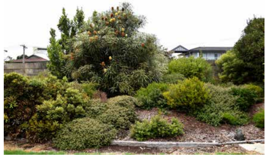
The Banksia Bed. Kevin Sparrow.

flowering plants. In 2014 the Swan Reserve Garden became an annex to the Warrnambool Botanic Gardens.