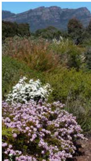
Wartook Gardens. Royce Raleigh.

When Jeanne and Royce Raleigh moved from Melbourne to Wartook at the end of 1974, they had always planned to develop a large native garden. Their aim was to show the public that there are many beautiful Australian plants that can be grown, but generally not available in nurseries. The garden, initially 100 square metres, now covers five acres. Over the years they have overcome waterlogging, droughts and bush fire. A 2.4m high fence was built to keep out rabbits, emus and kangaroos. Their garden is always evolving and is like a botanical garden showcasing plants from all over Australia such as Dampiera , Lechenaultia , Hakea , Verticordia , Eremaea , Beaufortia and Eucalyptus among others.