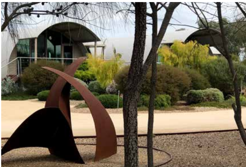
Grannes Garden. Glenda Lewin.

In 1995, Glenda and Greg Lewin purchased 50 acres of farming land (formerly the Stawell Airport). Ten acres of this was rabbit proofed in preparation for their permanent home and garden. In 1996, the first native trees were planted randomly on the site and these are the mature trees on the property today. Their home was built in 2001 and the immediate surrounding gardens were planted. The original garden design was the work of Barb Reading who believed the garden should reflect the iconic Australian design of the house. In that design, Glenda and Greg wanted to incorporate natural stone and steel with the addition of sculptural features to enhance. Barb sought to create a garden that combined plantings of endemic Grampians natives together with the more exotic WA gems. The beauty of her work was through her artistic eye – bringing perspective, subtlety, simplicity and colour through the combination of plants used.