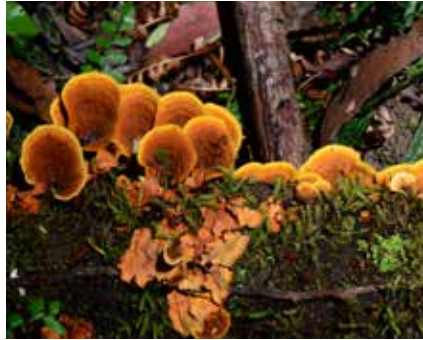
Fungi - Grey River Walk. Maree Goods

track divides in 100 metres, the left dropping down to the stream (maybe 100 metres) and the right branch does a gentle climb to a small lookout. Great mountain ash become apparent here with their buttressed trunks and giant Blackwoods with not a branch for 25 metres. Look out for the rare antechinus ( Antichinus minimus , Swamp Antechinus). The view across the river presents a wall of tree ferns and Manna Gums.