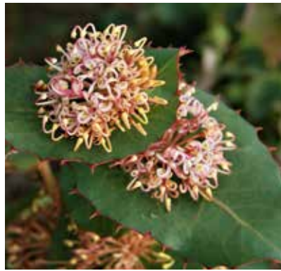
Hakea amplexicaulis . Neil Marriott.

be allowed to visit and tour this fine garden. A unique feature of the Myer Garden is the beautiful 2 metre tall Grampians sandstone wall that surrounds the garden.