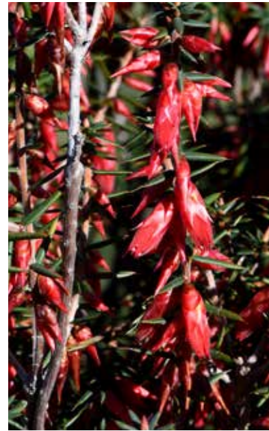
Stenathera conostephioides . Maree Goods.

There are pockets around the base of the Mt Arapiles which tour attendees will be able to explore to see the diversity of the plants and orchids that grow in the Park.