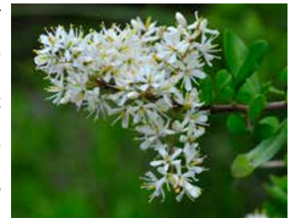
Bursaria spinosa . Chris Clarke.

Spring is when the smaller wildflowers of the Wilsons Promontory National Park really come into their own and provide eye-catching displays. The bright red pea-flowers of the Running Postman, Kennedia prostrata run across the ground with the Common Flat-pea Platylobium obtusangulum and Handsome Flat-pea Platylobium montanum