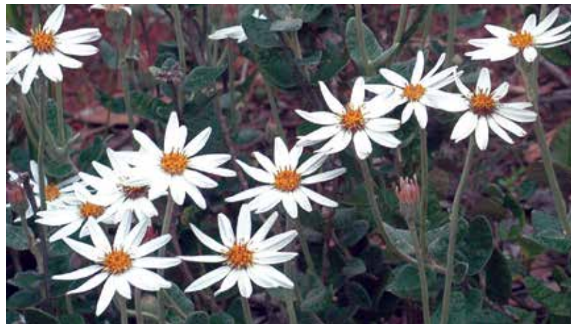
Olearia pannosa subsp. cardiophylla. Velvet Daisy-bush.