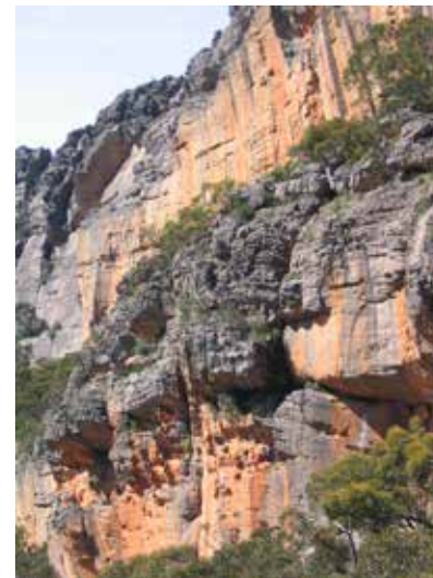
Endemic Grampians Grey Gums Eucalyptus alaticaulis on cliff lines. Neil Marriott.

The Grampians in western Victoria are known as Gariwerd to our First Nations people. They are a biodiversity hotspot with over 1,300 native plant species, over one third of the entire state's flora. The Grampians were formed during the Ordovician and Silurian periods when a former large inland lake bed of deep sands and gravels was uplifted along a series of fault lines resulting in the creation of a number of steep sided ranges known as cuestas; steep cliff lines along the east, gently sloping to the west. The region then underwent much erosion and deposition of shallow to deep beds of sands and gravels surrounding the ranges.