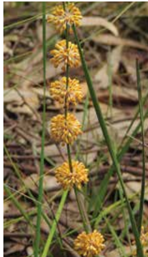
Lomandra multiflora . Mike Beamish.

The main features of the Reserve are the wetland areas that were first established in 1880 as a water supply for the steam trains that operated on the newly constructed (1877) Gippsland line. When an alternative (and more reliable) water supply became available in 1908, the reservoir fell into disuse and the original wooden weir wall collapsed, flooding parts of Traralgon and scouring out the