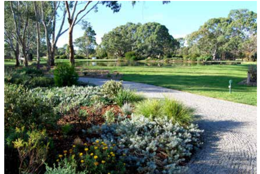
Myer Garden, Dunkeld. Neil Marriott.

The Myers Garden has undergone a series of makeovers and landscape designs over the years. Today it is noted for its lush, sweeping green lawns dotted with ancient River Red Gums Eucalyptus camaldulensis , and a series of gardens featuring large collections of grevilleas, eremophilas, dryandras, hakeas and many more!