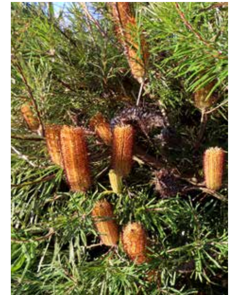
Banksia spinulosa var. cunninghamii . Paul Kennedy.

Paul and Barbara have traveled extensively across Australia to see what conditions Australian plants are growing in and then try to replicate this in their own garden. As some Australian plants are now becoming endangered, gardens of this type are extremely important in providing seeds and cutting material to enable these plants to be introduced into other gardens so they do not become extinct.