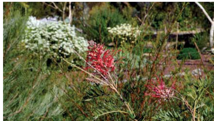
Brouwer Garden. Mabel Brouwer.