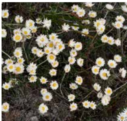
Argentipallium obtusifolium . Chris Clarke.

Often in striking combination with the yellow-flowered plants are the rich mauve-pink flowers of Tetratheca ciliata , and the erect flower-stalks of the Purple Flag, Patersonia glabrata , which prefers a spot where there is some moisture available as does its larger close mainly white-flowered relative, Diplarrena moraea . This White Iris has been successfully mass planted at the National Botanic Gardens in Canberra.