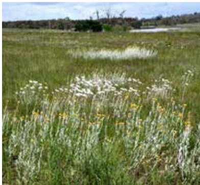
Restored native grassland. Maree Goods.

The rural district of Woorndoo in south-western Victoria is renowned for the beauty, diversity and abundance of its remnant native grasslands and grassy woodlands. The district straddles Salt Creek, which flows from Lake Bolac in the north to join the Hopkins River to the south. These waterways and associated lakes and wetlands are critical habitat for the Short-finned Eel ( Anguilla australis ) as they undertake their extraordinary migration to and from their breeding site in the Coral Sea, south-east of New Guinea. At Woorndoo, Salt Creek forms a geological boundary with the basalt-derived heavy clays of the VVP to the east and the sedimentary soils of the Dundas Plateau to the west. However, both soil types support a similar and diverse suite of native spring-flowering forbs with two of the very best remnants represented by the Woorndoo Common and Woorndoo Cemetery. The district is serviced by wide '3-chain' road reserves, which support the majority of the high-quality remnants in this highly modified and productive agricultural landscape. The structure and diversity of these communities can be attributed in large part to Aboriginal land management practices over millennia. More recently, a decades-long history of consistent annual