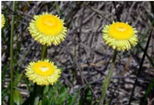
Coronidium scorpioides . Maree Goods.

The 'Res', as it is affectionately known by locals, was established during the late 1980's when the land became superfluous to the owner's requirements and was handed back to local government control. It is 29.5 hectares in size and protects some bushland and grassland that was never cultivated or converted to pasture, and so still contains the native herbs grasses and shrubs that are indigenous to the threatened Gippsland Plains ecosystems. For example, the Button Everlasting Coronidium scorpioides and Lomandra multiflora occur here.