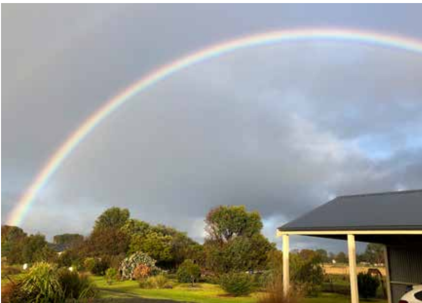
Rainbow over The Rocks Garden. Ross Dawson.

paths meandering between them to encourage people to walk through and admire the plants. Each garden bed has a different theme. The plants have been chosen for several different reasons – colorful flowers, contrasting foliage, a reputation for growing well in the area and just because they are interesting. The owners say ‘we wanted variety and we sure have that’. There is plenty of wildlife too.