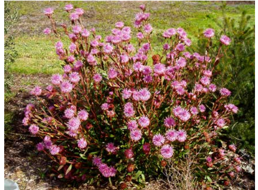
Isopogon Stucky's Hybrid. Paul Kennedy.

The Kennedy garden is unique in that it contains 165 of the 169 Hakea species and 86 of the 98 Banksia species of Australia. So in one location you can see nearly an entire collection of two genera. Paul is the leader of the Hakea Study Group. There are also many other native plants such as melaleuca, isopogon and calothamnus to be seen in their garden. The soil is 900mm of sandy loam over heavy clay with a rainfall of approximately 750mm that comes mainly in the July - November period. The winters are cold and the summers warm with a few hot days. The garden was commenced in July 2014 and because of the