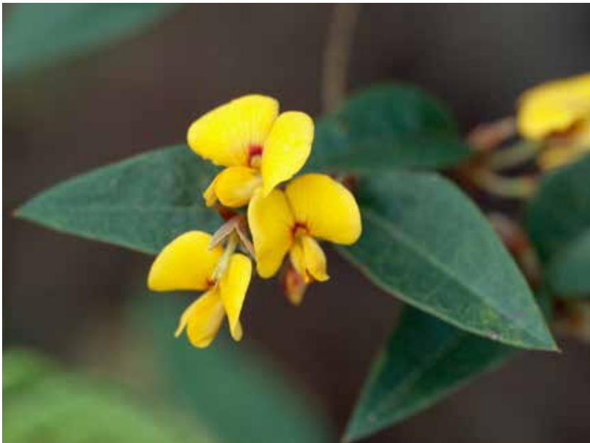
Platylobium montanum . Chris Clarke.

rising slightly taller to display their broad yellow and red pea-flowers. Splashes of bright yellow are also provided by the Rough Guinea-flower, Hibbertia aspera , and the daisy flowers of Chrysocephalum apiculatum , Common Everlasting. Other stunning daisies include Chrysocephalum baxteri and the tricky to pronounce Argentipallium obtusifolium .