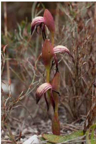
Pyrorchis nigricans . Chris Clarke.

To visit areas such as Wilsons Promontory in the seasons following a bushfire can be a memorable experience. Many orchids flower profusely after fire including Pyrorchis nigricans or Red Beaks.