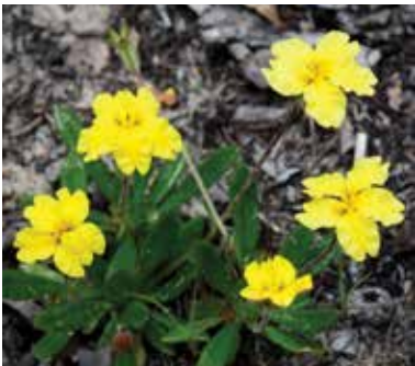
Bent Goodenia. Goodenia geniculata.