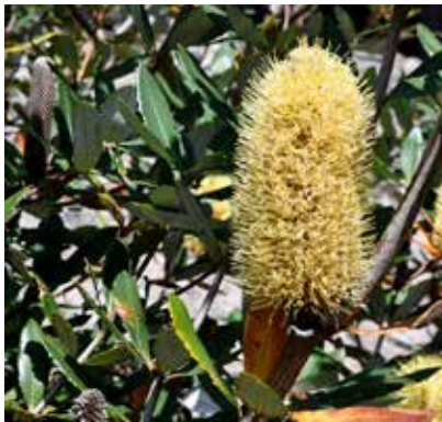
Banksia saxicola flower. Maree Goods.

Two banksias of smaller dimensions found in this area are Banksia marginata , the Silver Banksia, and Banksia cunninghamii , Hill Banksia. They can grow as shrubs to 4m or more in height, or in exposed coastal heathlands their size may be restricted to just a metre or so tall. Banksia saxicola is also present in the north-eastern sector and its only other natural occurrence is in the Grampians in western Victoria. A remarkable dislocation!