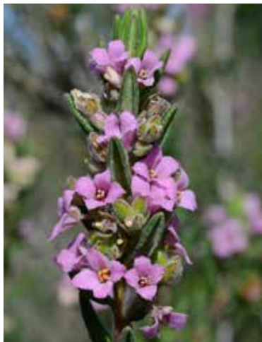
Zieria veronicea . Maree Goods.

Some of the understory plants are Calytrix tetragona , Phebalium stenophylla , Correa reflexa subsp. scabridula , the endangered species of Zieria veronicea and several other species.