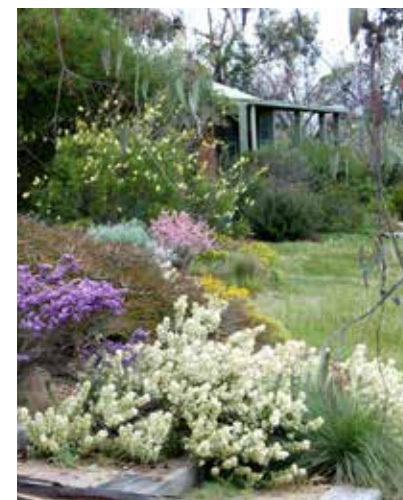
Panrock Ridge garden. Neil Marriott.

species), a large Mallee eucalypt garden, Acacia garden, rainforest gully and much more. The gardens are designed primarily for wildlife with over 180 native birds being recorded for the property as well as numerous native animals and reptiles.