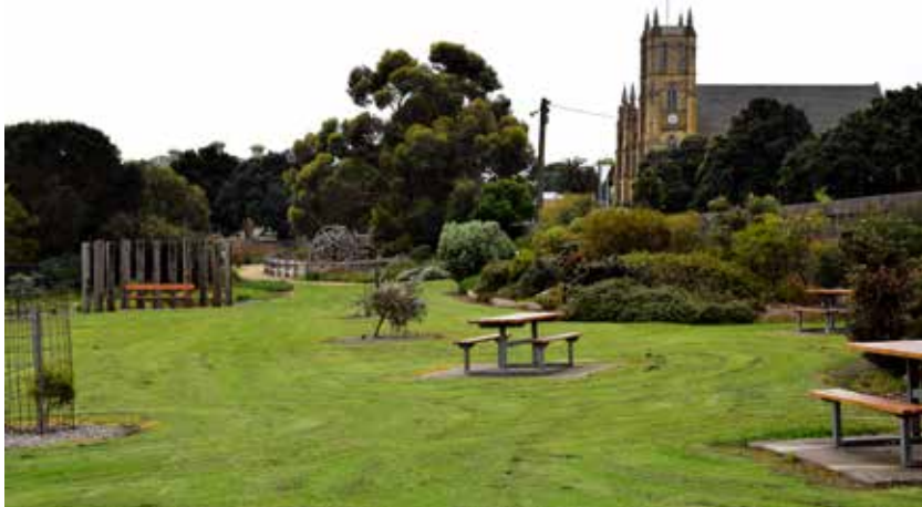
James Swan Reserve. Kevin Sparrow.

The site was originally reserved for use as cattle yards and as a general market in May 1883. They were expanded in 1904 and finally closed in 1970 due to noise, odour and road duplication. The limestone wall on the northern boundary is the only remnant of the old sale yards.