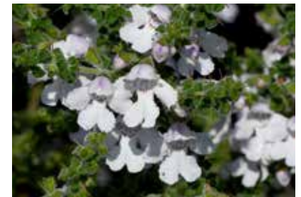
Prostanthera arapilensis.