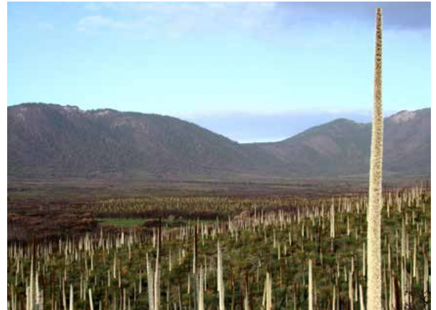
Northern Wilsons Promontory, Xanthorrhoea australis after 2009 fire. Reiner Richter.

A spectacular and significant plant of the Wilsons Promontory National Park is undoubtedly the Grass-tree, Xanthorrhoea australis . It is widespread throughout the park and certainly very eye-catching when the flower-stems to 3m tall are produced. Flowering does not occur every year, but an abundance of flowers is usually seen after fire and can provide memorable displays. This will certainly be the case this spring. The trunkless X. minor subsp. lutea is also present and plants can bear multiple flower stems.