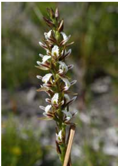
Prasophyllum odoratum, the Anglesea Leek.

A third orchid, endemic to the area is Prasophyllum odoratum , the Anglesea Leek Orchid, recognised as being a separate member of the Scented Leek Orchid group. The sweetly scented green and brown flowers have a long, white labellum with wavy edges.